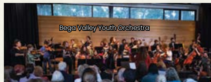
Bega Valley Youth Orchestra